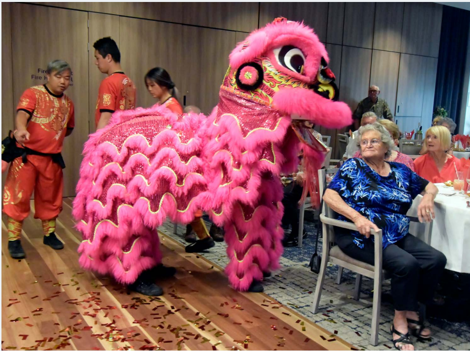
Chinese New Year

A la Carte night 4th Wednesday of every month